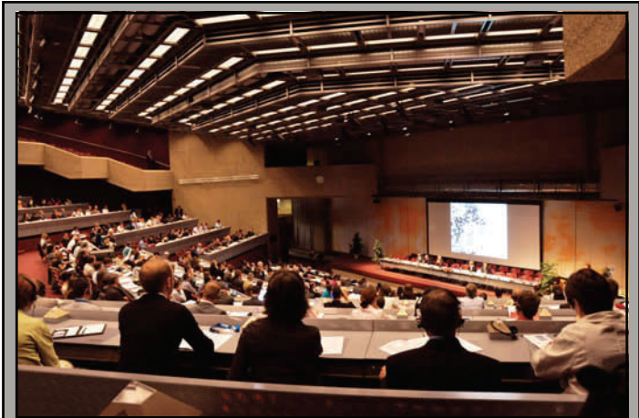
A view of the presentation hall of the 8th European Conference on Digital Archiving in Geneva, Switzerland. Nearly 700 people took part in the conference which was held April 28 th -30 th , 2010, at the International Conference Centre Geneva.

Scotiabank Group Archives serves, and has for many years served, as the gatekeeper for records in all media and formats being transferred to offsite