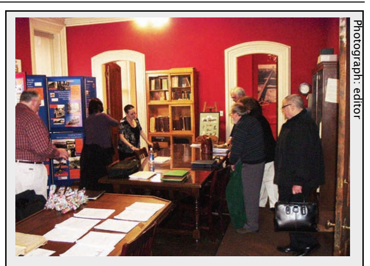
Members of the board prepare for the mid-year meeting in the reading room of the Cuyahoga County Archives in Cleveland, Ohio.