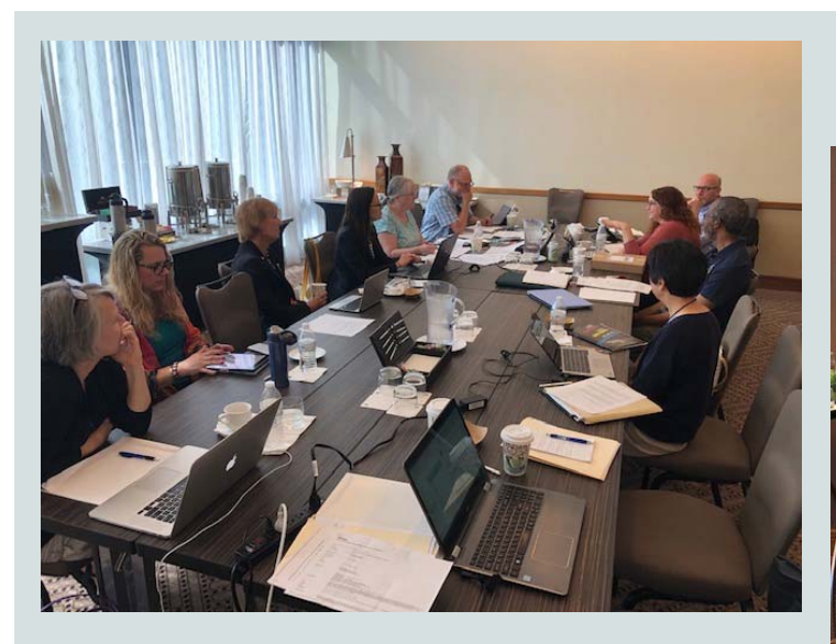
ACA Board Meeting, August 2019

It might have been the night at the Moody Theater or it might have been the exhibit and edible logos at the Briscoe Center, but I'm pretty sure it was the collegial environment and excellent sessions that left me ready for my next role as an archivist. Thank you to the ACA and the Legacy Travel Award committee for the opportunity and the much-needed re-immersion in the archives conversation!