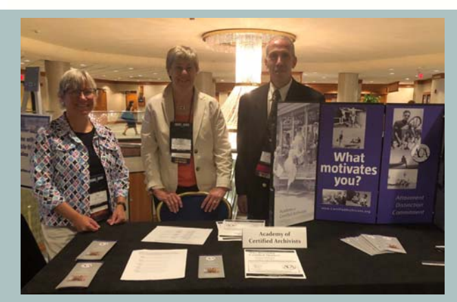
Volunteers at the ACA table at SAA